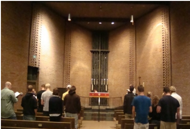
Singing Vespers during Christ on Campus Retreat