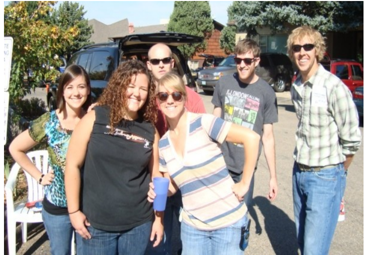
ULC Students at CU Football Parking

Help choose where Thrivent Financial for Lutherans gives back!