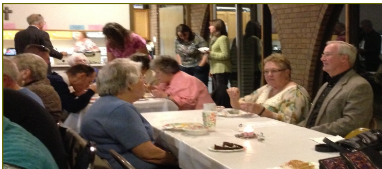
Enjoying dinner and conversation after the Service